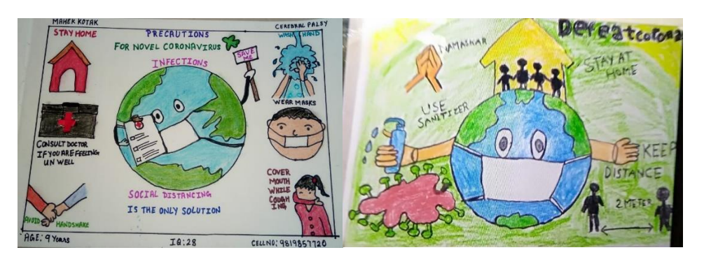
Award Winning Paintings

We congratulate all school children, teachers, parents and principals for having participated with such enthusiasm. We applied the stupendous efforts put in by the special children and their parents.