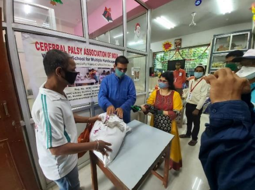
Ration kit distribution on 25th June 2020. We are distributed 310 kits