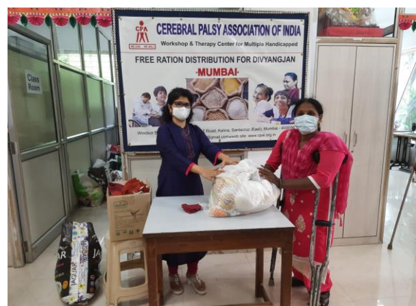
At Mumbai Center 2021