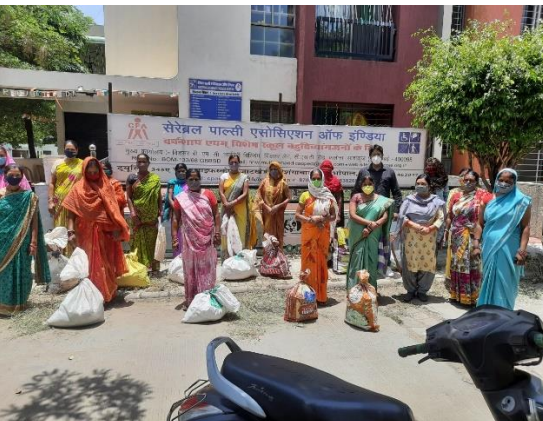
At Bhopal Center 2021