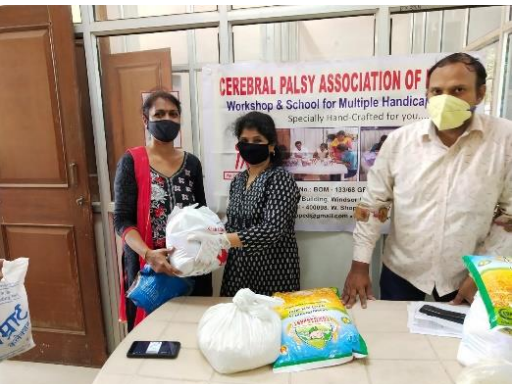
Ration kit distribution on 24th May 2020. We are distributed 200 kits