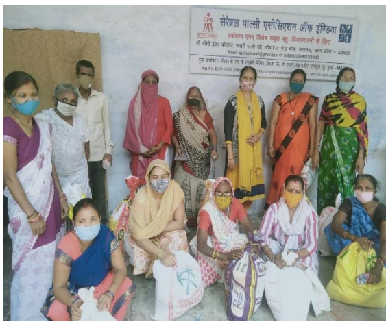
At Lucknow Center 2021