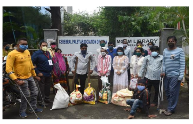
Ration kit distribution on 26th Aug. 2020. We are distributed 400 kits