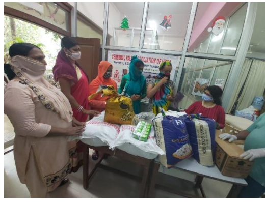
Ration kit distribution on 26th June 2020. We are distributed 350 kits